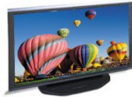
Typical Plasma Display

Park noted that there are many computational models available for plasmas used in displays, but none of these has been verified by direct measurement of plasma parameters. Furthermore, these models, which are based on plasma mobility and diffusion, may not be adequate for the kinds of discharges used in displays. A better theoretical understanding that can accurately predict performance is essential.